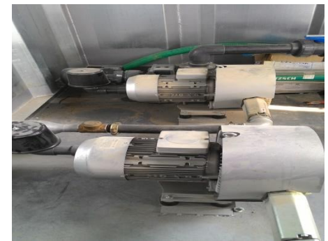
Pump Room Sealine