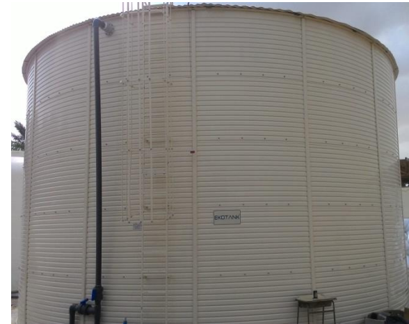
CONSTRUCTION OF 420 M 3 EKOTANK , SEALINE BEACH RESORT