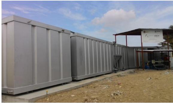
400 CMD STP Sealine